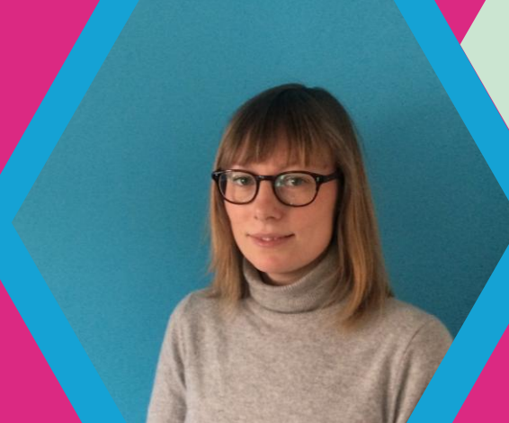
Senior Project Manager